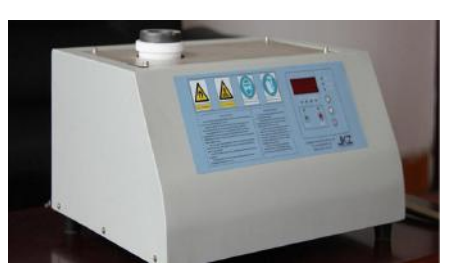
Precious Metal Melting