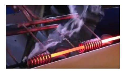
Induction Annealing And Normalizing